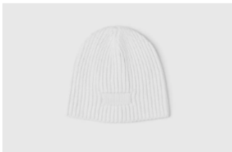
Beanie Maison Margiela x Highsno