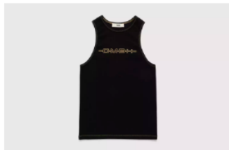
Ali Rib Tank Top GmbH